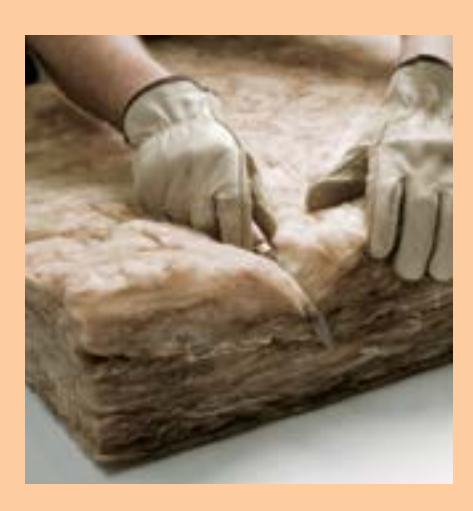
EcoBatt insulation ensures the professional touch —consistent quality, low dust and easy to cut—handling characteristics that you've come to expect from Knauf Insulation.