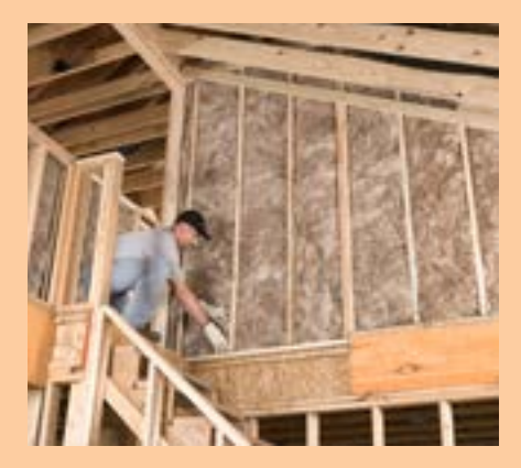
EcoBatt insulation is naturally brown— assures no phenol, formaldehyde, acrylics or artificial colors are used in the manufacturing process.

All Knauf Insulation products are inherently sustainable because of high recycled content. They save hundreds of times more energy in use than is required to manufacture them. EcoBatt insulation is even more sustainable because its ECOSE Technology helps reduce our carbon footprint further by eliminating the traditional non-renewable petroleum-based binder chemistry.